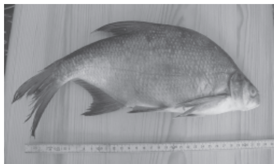
Fig. 2. The specimen from Orhon river.