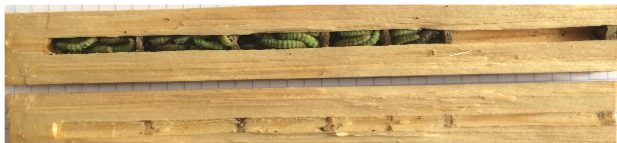
Fig. 2. Euodynerus dantici nest; this type was common and seen in 12 nests. Eggs are seen in lower section of nest in cells 2, 4 and 5. The prey (noctuid caterpillars) are seen in upper section of nest.

*Thickness of outermost layer when closing plug consists of 2 or 3 layers