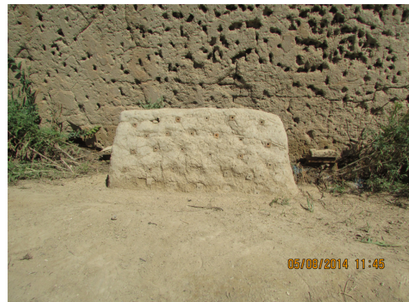
Fig. 1. Bundled trap nests occupied by females of E. dantici (left), trap nests inserted in artificial mud block (right) set up in front of nesting aggregations of E. dantici .